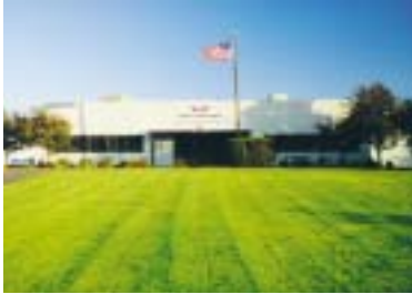
Graver Technologies • Honeoye Falls, New York Manufacturing and Development site for Consler Filtration Products