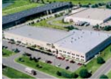
Graver Technologies • Glasgow, Delaware Corporate Headquarters

Graver Technologies designs, engineers and manufactures Consler brand filtration systems using pleated elements and ASME code vessels. You'll find our filters in a broad range of industrial applications including chemical processing, natural gas, power generation, and industrial gas production. In addition to a wide range of standard filters and vessels, Graver Technologies specializes in custom engineered solutions to meet specific application requirements.