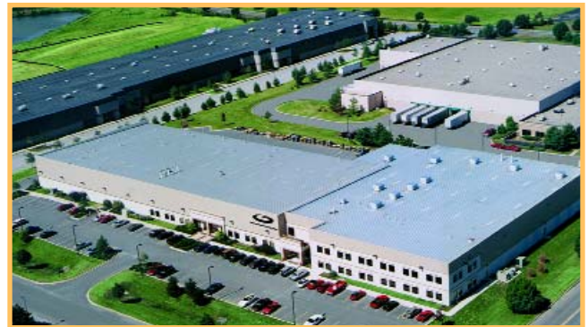
Graver Technologies Glasgow, Delaware • Corporate Headquarters

Graver Technologies is a member of the Marmon Group of companies, a privately held concern with over $6 billion in annual sales. Graver Technologies delivers products that facilitate and enhance separation, purification, and process filtration. Graver Technologies has the technical resources and financial strength that make us the perfect partner for your business, whether it's around the corner or around the world.