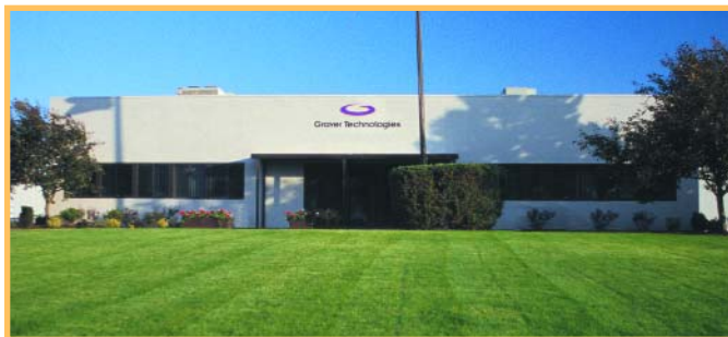
Graver Technologies • Honeoye Falls, New York Manufacturing and Development site for Industrial Filtration Products

Manufacturing/Distribution Centers Glasgow, Delaware Honeoye Falls, New York Newark, New Jersey Esslingen, Germany