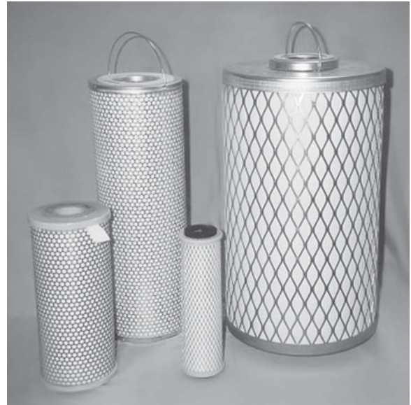
Cartridges are filled with Hilite A, a highly porous aluminum oxide filter media.

NOTE: High temperature cartridges for 600° F (315° C) operation are available on special order. Contact Hilliard or your Hilco distributor for details.