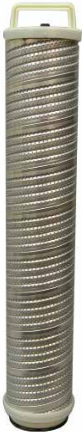
ACTIVE CARBON ELEMENT