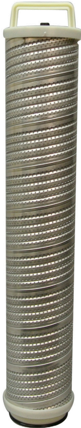
CLAY TREATING ELEMENT

REDUCE OR ELIMINATE HAZE AND POLAR SURFACTANTS