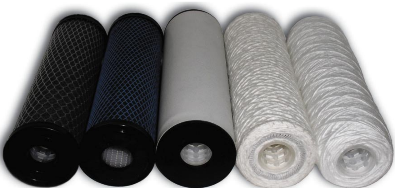
UPAMC Impregnated Carbon

Many factors influence the rate and magnitude of adsorption on activated carbon. A few of the more important factors are the chemical nature of the substance being adsorbed, the type of solution it is being adsorbed from, and the type of system in which the carbon is being used. Due to those factors and our desire to meet each of our customer's needs, we manufacture and provide a wide range of activated carbon cartridges.